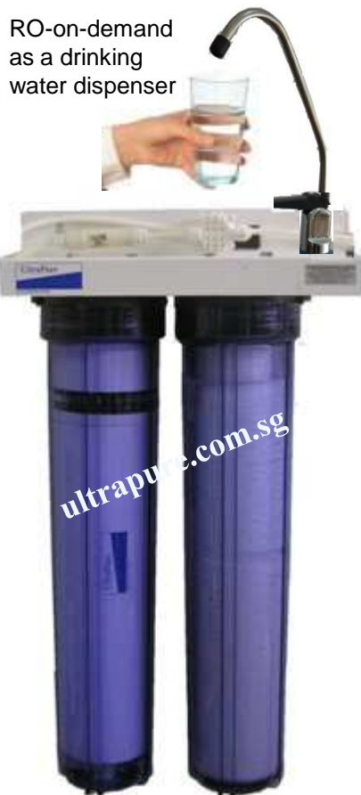
RO-on-demand as a drinking water dispenser